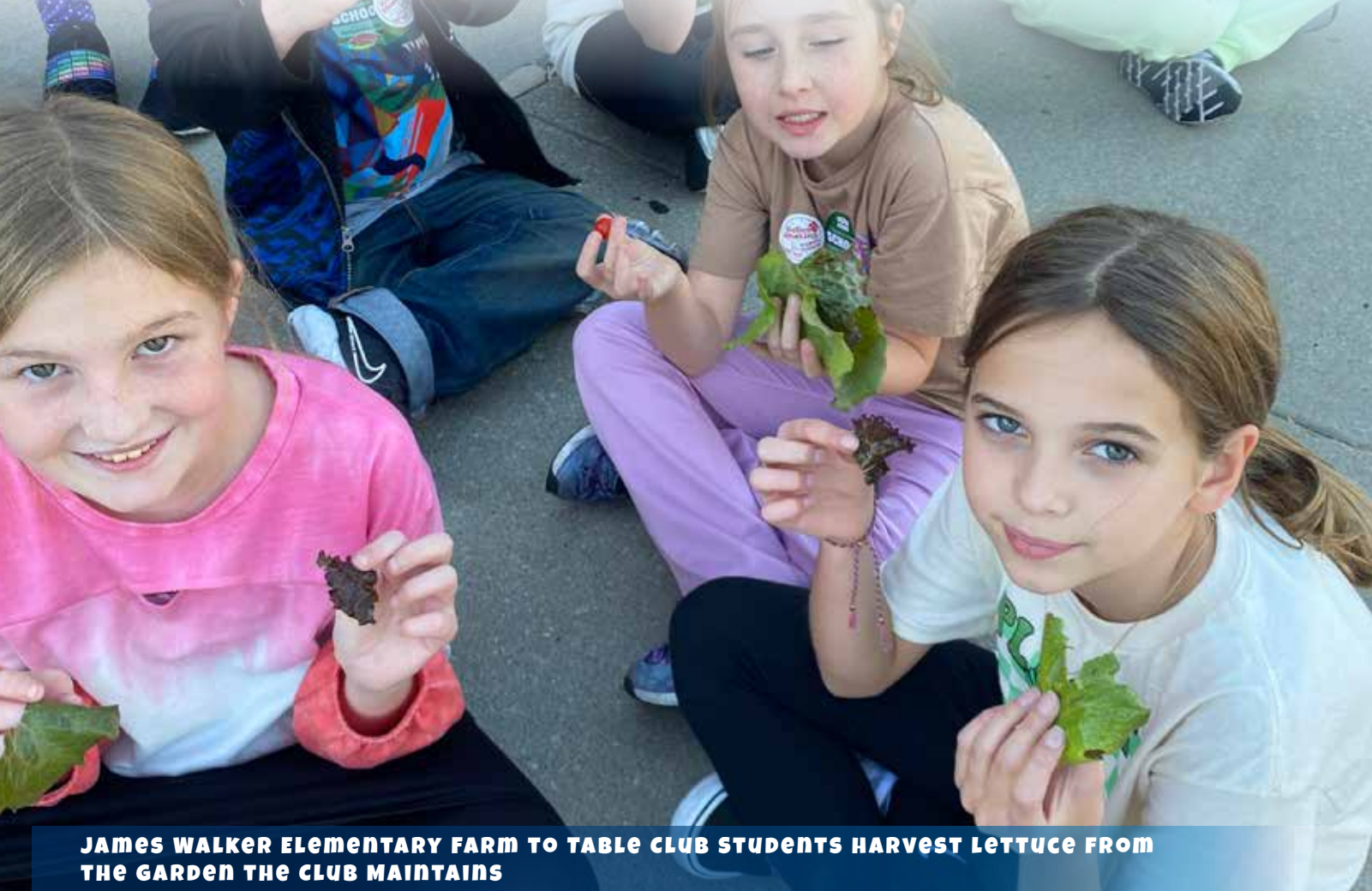
JAMES WALKER ELEMENTARY FARM TO TABLE CLUB STUDENTS HARVEST LETTUCE FROM THE GARDEN THE CLUB MAINTAINS